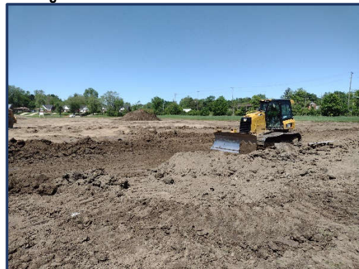
June 2, 2022 Grading of habitat areas