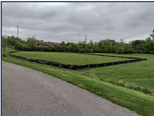
May 20, 2022 SESC measures installed