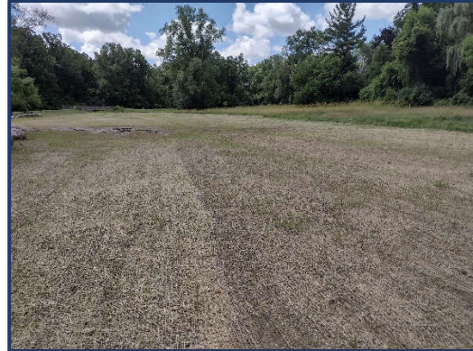
July 12, 2022 New growth in native area