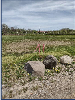
May 12, 2022 Staking out site