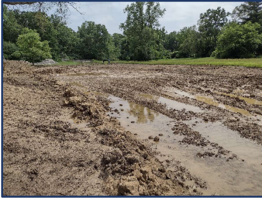
June 14, 2022 Wetland grading