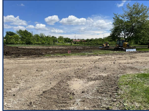
May 27, 2022 Begin site grading