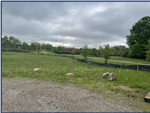
May 19, 2022 SESC measures installed