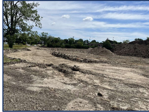
July 2, 2022 Wayne County putting parking lot to enhance access to habitat areas