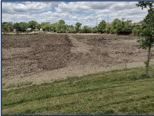
June 27, 2022 Invasive species removed and spoils area grading