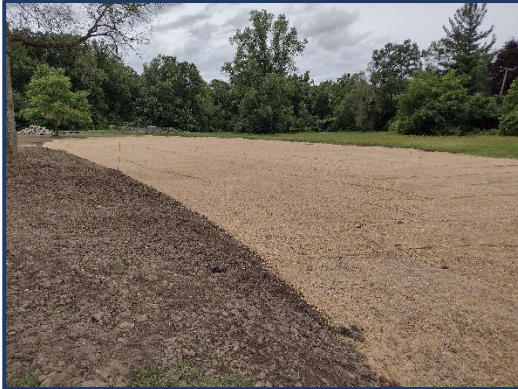
June 20, 2022 Native area seeded and protected with erosion blanket